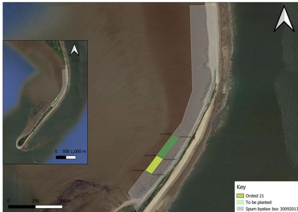
Figure 1: Seagrass restoration at Spurn Point, Humber Estuary. 'Orsted 21' illustrates to the area planted in 2021 for Hornsea Four and 'To be planted' is the remaining area to be planted in 2022-2023 to total 4ha of seagrass restoration.

7.2]. Once collected, these seeds will either be planted immediately or stored in an appropriate facility until the following season.